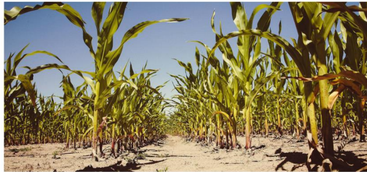
Researchers noted that farmers could harness the linalool-driven feedback to cut chemical use. Representative image.

The researchers noticed this effect when comparing maize planted at different densities. In the most tightly packed plots, plants in the middle rows suffered far less insect damage than those at the edges. The crowding seemed to boost protection. But this stronger defence came at a cost: plants also grew more slowly and produced less biomass, revealing a trade-off between protection and productivity.